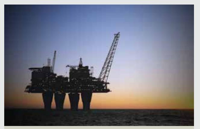
agio Fountains, Las Vegas Oil Platforms Around The World