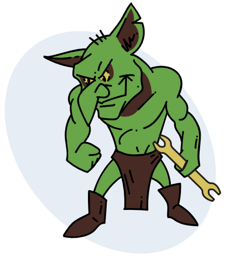
Application of excessive torque is one of the ways gremlins sabotage valves.

A new valve design often begins with an industry standard, such as ASME B16.34 or API 6D, and focuses on the end user's required performance of the valve for an application and set of service conditions. It typically includes consideration of safety, reliability, manufacturability, cost of manufacturing, and marketable features. But often the missing design parameter is one of the most important to an end user- repairability. After all, "Valves never leak." That statement will give any plant operator or startup engineer a good laugh. They know that even the best-designed and most robust produced valves can be damaged, experience seat wear, or require retrim.